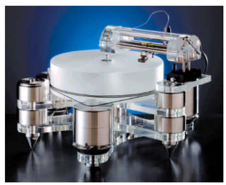
Clearaudio Master Reference Playback System

My first thought was to alternate my choice for an ultimate system with one nearly as good but dramatically less pricey, one centered around Magnepan's stratospherically good MG-20.1, itself one-tenth as dear as