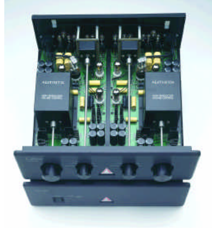
Aesthetix Callisto Line Stage

pages and I am going to refer you to back issues if you want to explore their "sound" at some length. At last, there are competitors coming up from the rear to challenge some of the Burmester's king-of-the-mountain status. The humbly priced Gamut CD-1 player, while no Burmester killer, does have a greater truth and musicality in the middle frequencies, suggesting that an update ought to be in the makings, whether it is or not at the German factory. I, for one, won-